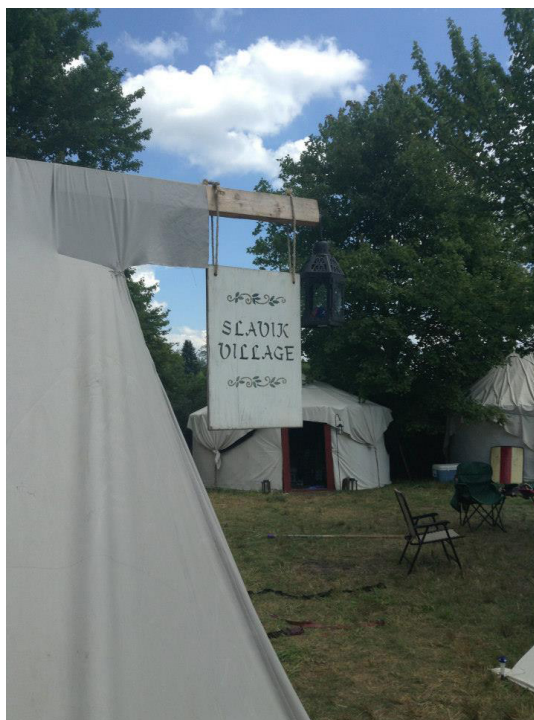
A photo of Slavik Village