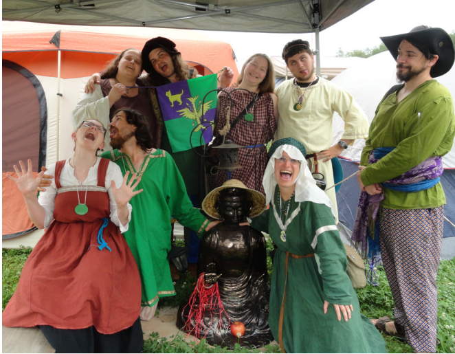
Photo of the campers at House of the Three Roses courtesy of THL Niccoló Bartolazzi.