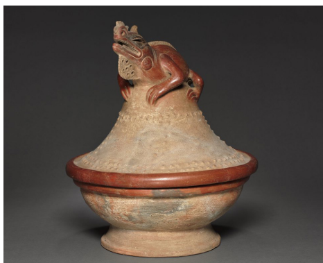
Lidded Bowl with Iguana - Costa Rica, 7th-12th century