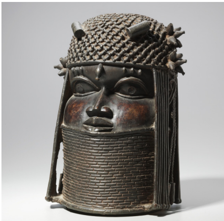
Ancestral Commemorative Head (uhunmwun-elao), Nigeria, Edo peoples, mid-1500s or early 1600s.

Brass, cast by Igun Eronmwon (Royal Brasscasters)