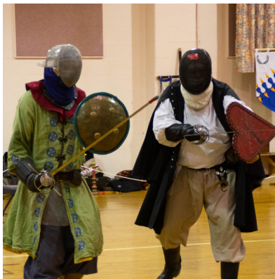
A pair of fencers at the tournament.