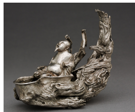
Raft Cup - China, 1345