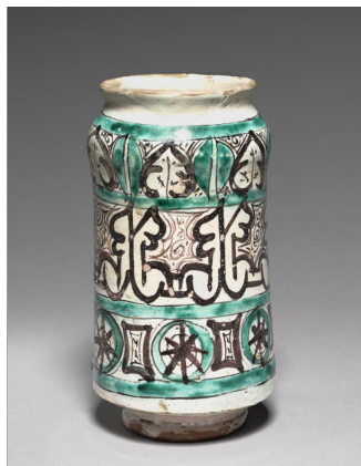
Albarelo with Pseudo-Kufic Letters - Spain, Paterna, 14th century