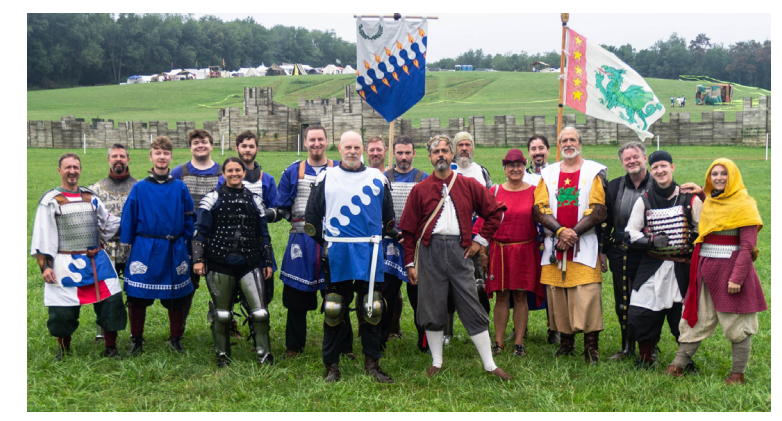
Cleftlands armored muster.

The children have Grown, even married. Or brought children of their own. The senior folk have gone grayer, and perhaps a bit slower. Or people were missing altogether, lost to time and the tides.