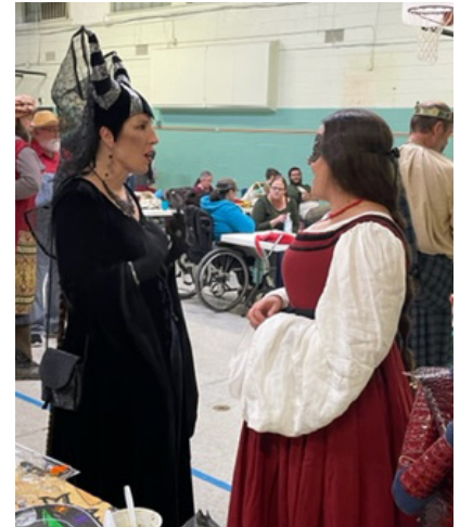
Top and bottom: Who are those disguised guests?