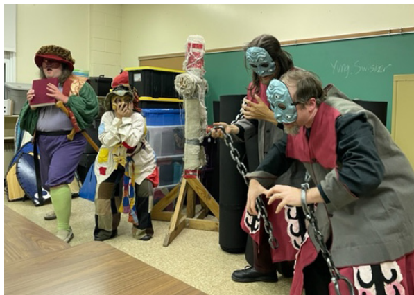
Above: iVerdi Confusi performs a tale of a dark summoning gone wrong. Or right?