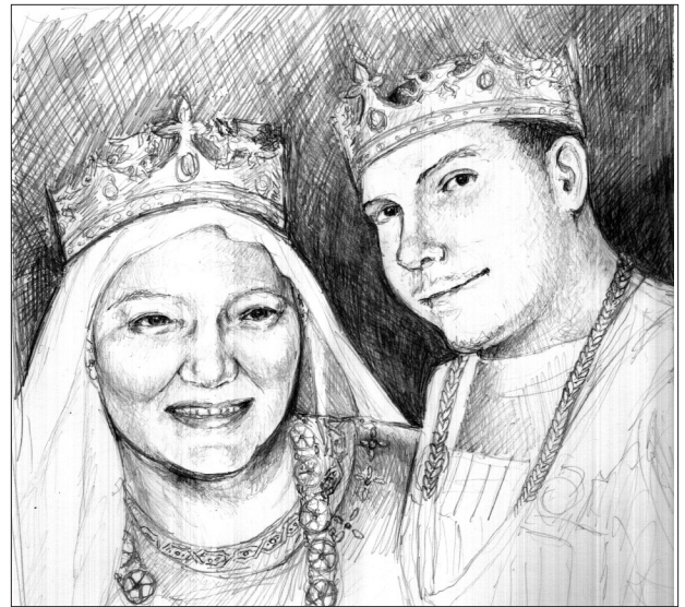
Their Highnesses