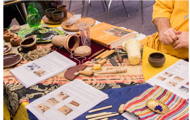
A display from a previous Kingdom A&S.

Kingdoms across the Known World hold A&S Fairs to allow their artisans to show off what they can do, learn about their crafts, and exchange ideas with others. At the Kingdom A&S Fair in the Middle Kingdom, entrants register to display a project along with documentation on the historical origin and inspiration for the project, as well as their process as they worked to completion. Judges then review the work and documentation with the entrant and assign scores based on a pre-set rubric. Unlike what we might be used to at the county fair, you are not being judged against other people. Each project receives its own score, and there are usually no "first place" awards. Sometimes the scores will be used for things like determining champions at Pennsic, etc.