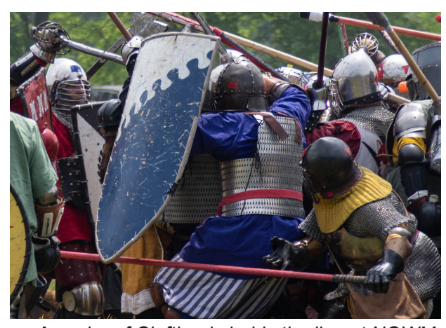
A squire of Cleftlands holds the line at NOWM.

Not content to merely have delicious, and beautifully presented, food, Master Aiden also displayed works of edible sculpture. The most impressive was a Venetian tower that was brought up to the