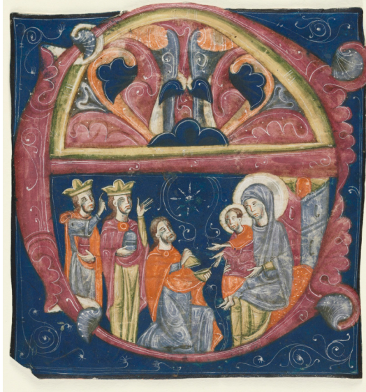
An illuminated letter "e" showing the three wise men giving gifts to Jesus, from a 13th century Italian choir book. In the book, this letter started a chant used at Epiphany.

Twelfth Night - Many events use this name, but what does it mean? As it says in the song "The 12 Days of Christmas" (although it's post-period, from 1780), there were (and for some, still are) twelve days of Christmas. December 25 was only the beginning of the holiday, with Twelfth Night at the end. The following day is Epiphany; said to be the day that the three wise men visited baby Jesus. Twelfth Night was a time of merriment and mischief, when things were turned upside down before getting serious again the next day. A king/queen of misrule was determined via right of cake - whoever found the dried bean or pea in the cake became ruler for the night. People might also go wassailing, going door to door with mulled cider or wine to wish good health to their neighbors.